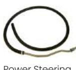
Power Steering System