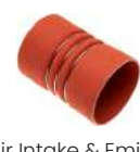
Air Intake & Emission System

Your heavy duty trucks and buses go further with Gates OE and OE equipment aftermarket parts. Gates have worked with heavy duty, commercial and industrial vehicle manufacturers to develop belt drives, engine hoses, and system components that keep your business moving forward, all while lowering your maintenance costs, downtime, and labour costs.